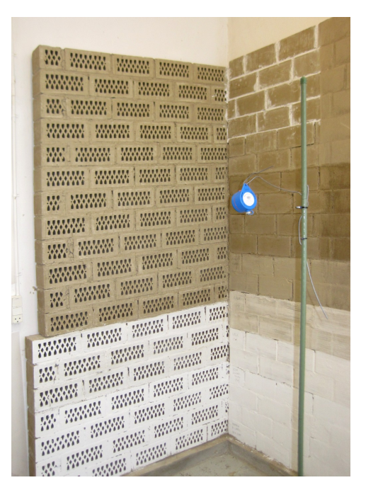
Figure 2: The inside corner of the room showing the perforated unfired brick and some areas with various experimental finishes, to reduce dusting.